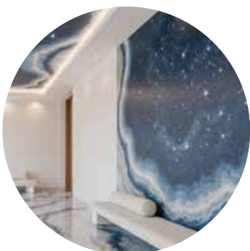
WALL COVERING Medical, Commercial & Residential