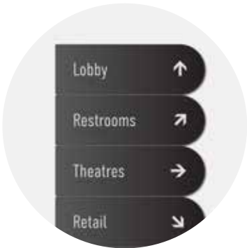
DIRECTIONAL + COMPLIANCE Signage for Inclusive Spaces