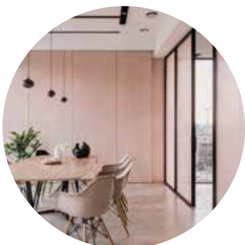
ACOUSTIC PANELLING Allowing Resonance