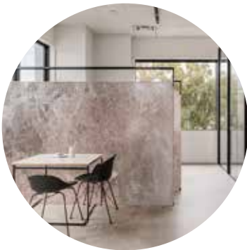
GLASS FILMS Safety & Privacy Films